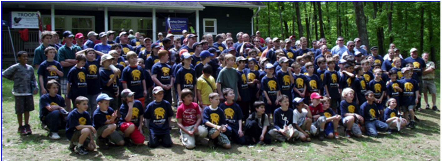
Photo: Our last Webelos WOW at Hoyt. For 2023 we have to put a limit of 70 youth plus one parent. This will fill up quickly. Get your registration in.