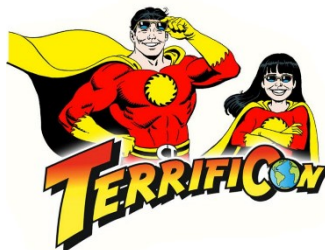
CT TerrifiCON booth, (August)