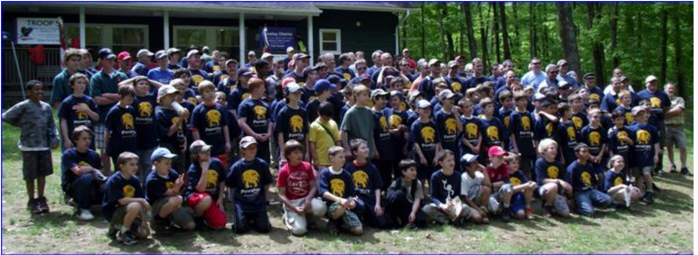
Powahay's last Webelos WOW